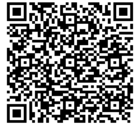
Michael Collopy – "Building Relationships through Photography"